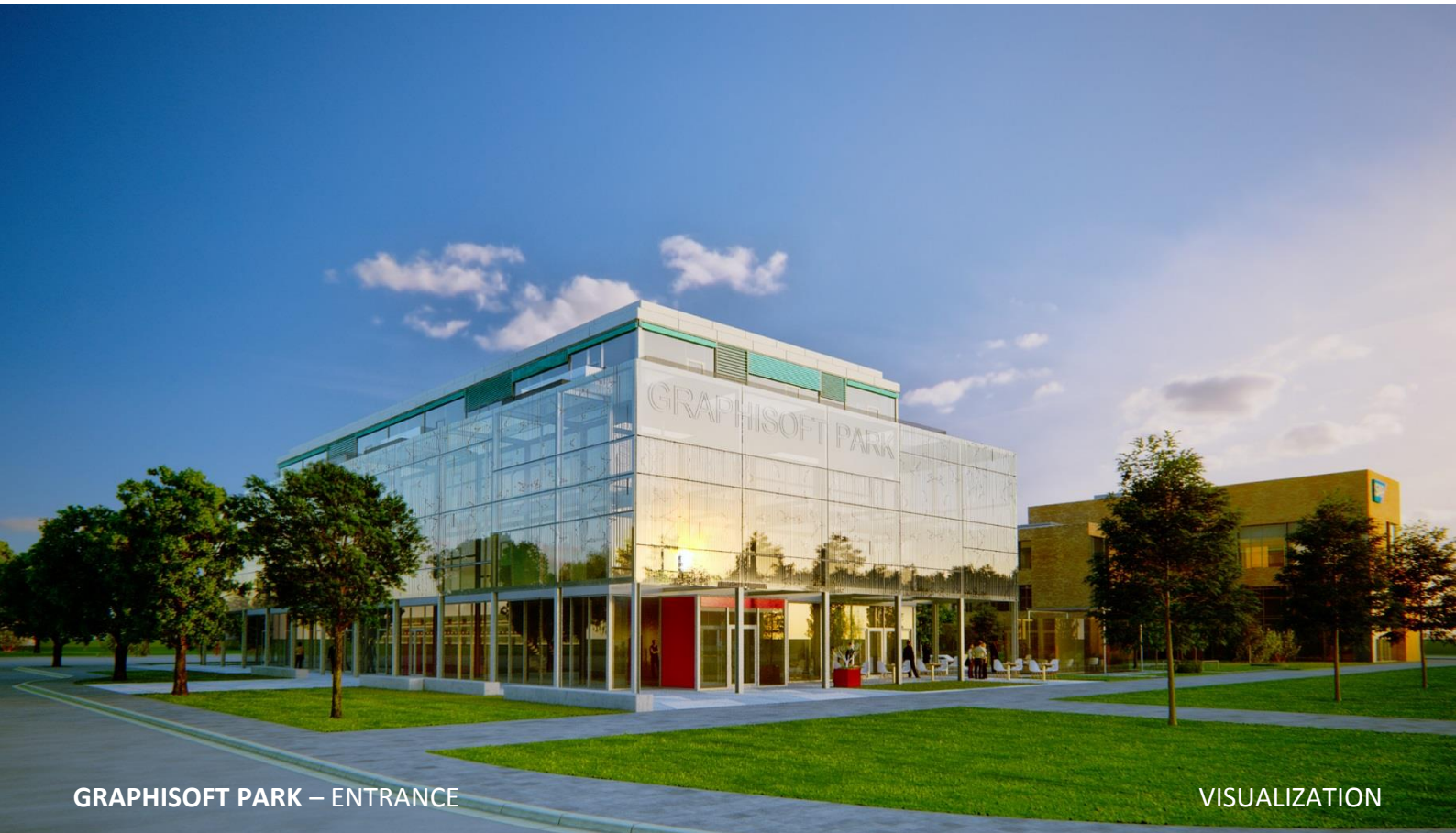
GRAPHISOFT PARK – ENTRANCE