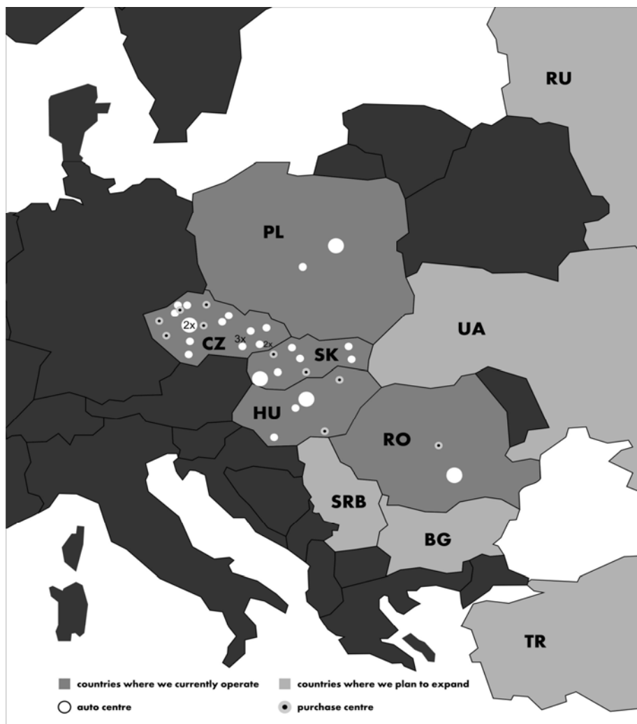
Geographic location of our business operations

The geographic location of our business operations is indicated on the following map: